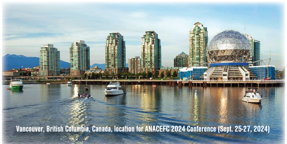
Vancouver, British Columbia, Canada, location for ANACEFC 2024 Conference (Sept. 25-27, 2024)